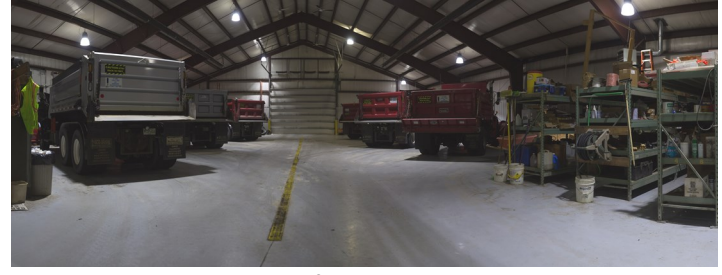
Front warehouse section before ALSET upgrade