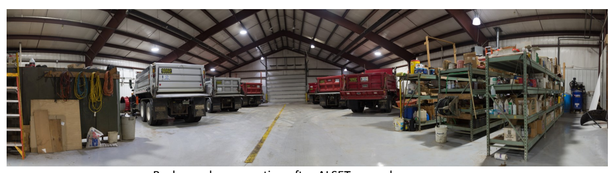
Back warehouse section after ALSET upgrade