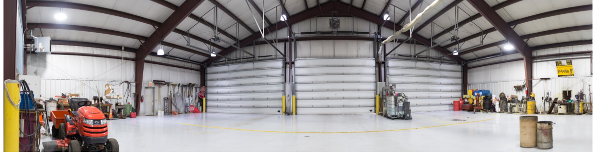
Front warehouse section after ALSET upgrade

The results achieved by Belvidere Township are consistent with other projects where ALSET LED's have been installed to improve less-than-desirable lighting conditions. With planning assistance from our knowledgeable lighting experts, fixtures in strategic locations were replaced with ALSET LED 28,800 lumen, 5000k highbays, producing results that are both economical and dramatic.